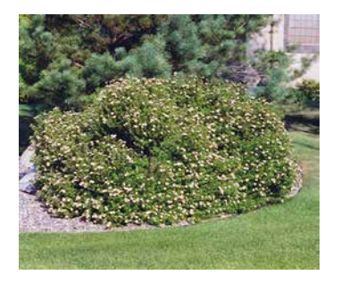
Full sun to partial shade + Dry to moist soil