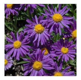
Alpine Aster ASTER ALPINUS

Full sun to partial shade + Dry to moist soil