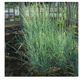
Blue Lyme Grass LEYMUS ARENARIUS 'BLUE DUNE'

Full sun to partial shade + Dry to moist soil